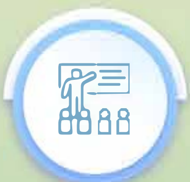
Classroom/ Lab activities