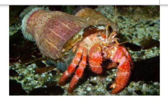
Lesson Plan: Climate Fiction "Hermie" - A Case of Climate Change

As a high school or undergraduate English Literature teacher, you can use this climate fiction short story to teach literary analysis of fiction through narrative strategies such as dialogue, chronology, and descriptive richness as used